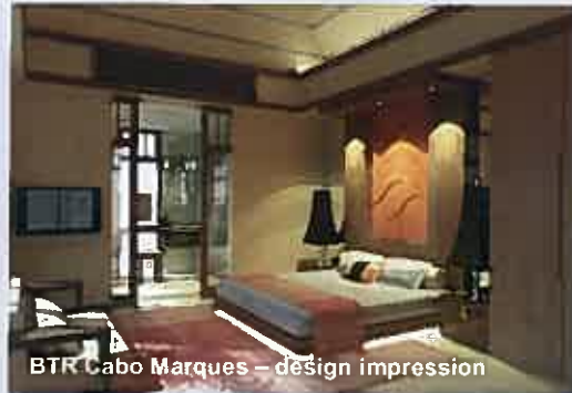
BTR Cabo Marques – design impression