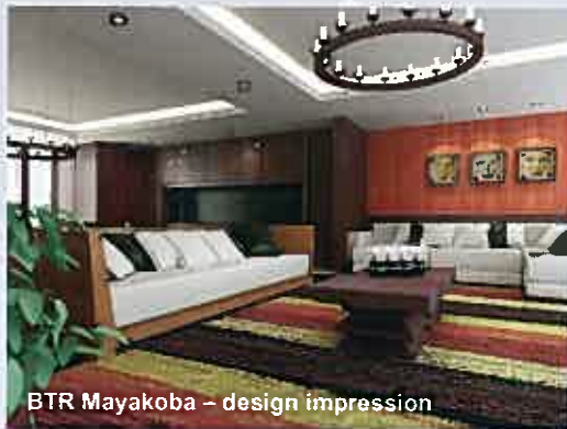
BTR Mayakoba – design impression