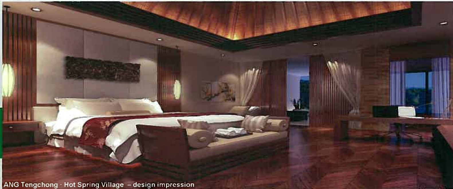
ANG Tengchong · Hot Spring Village – design impression