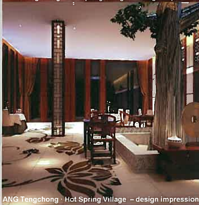
ANG Tengchong · Hot Spring Village – design impression