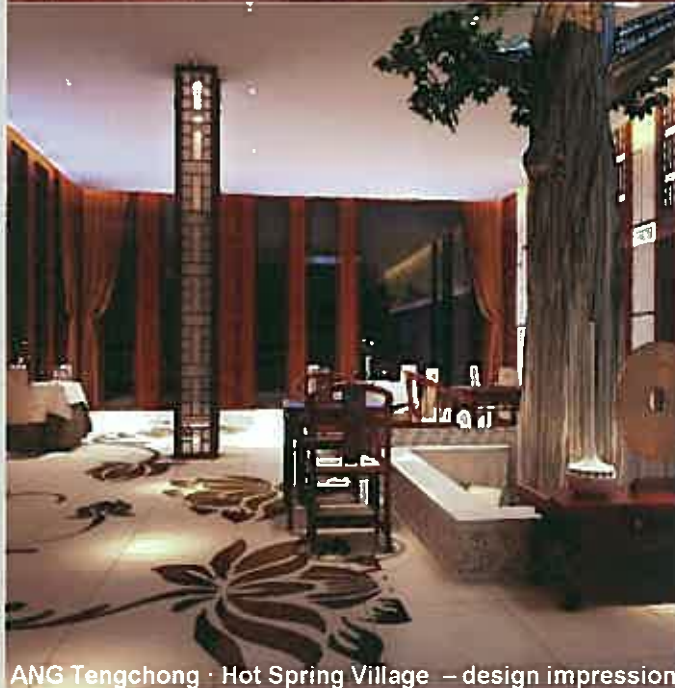
ANG Tengchong · Hot Spring Village – design impression