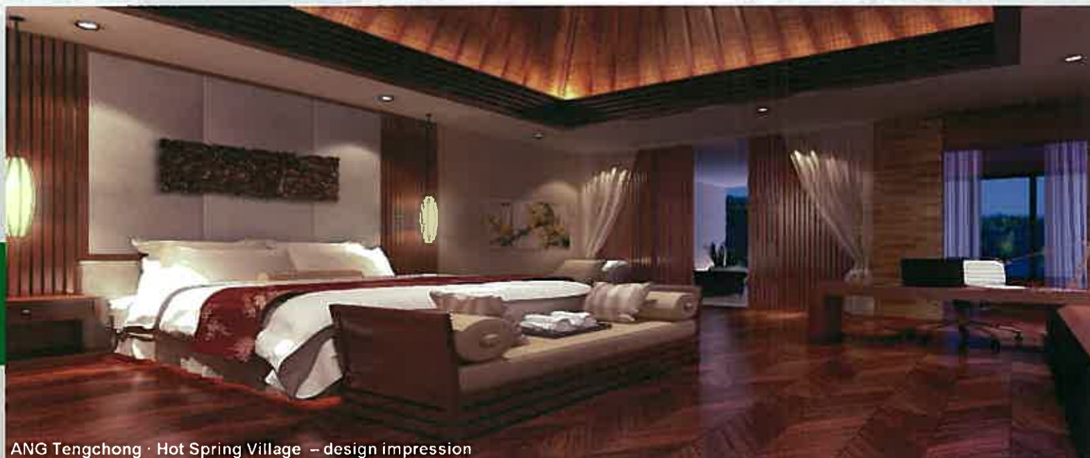
ANG Tengchong · Hot Spring Village – design impression