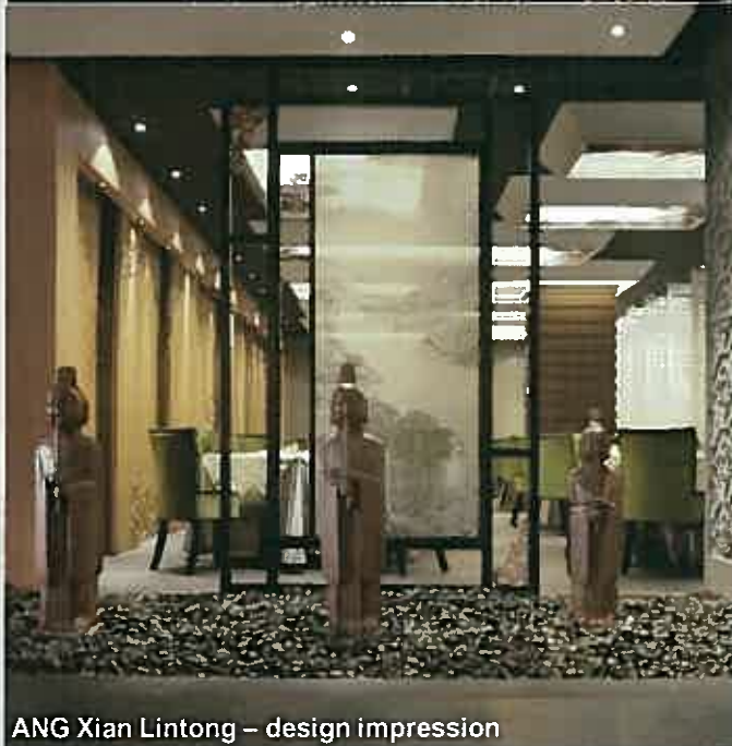
ANG Xian Lintong – design impression