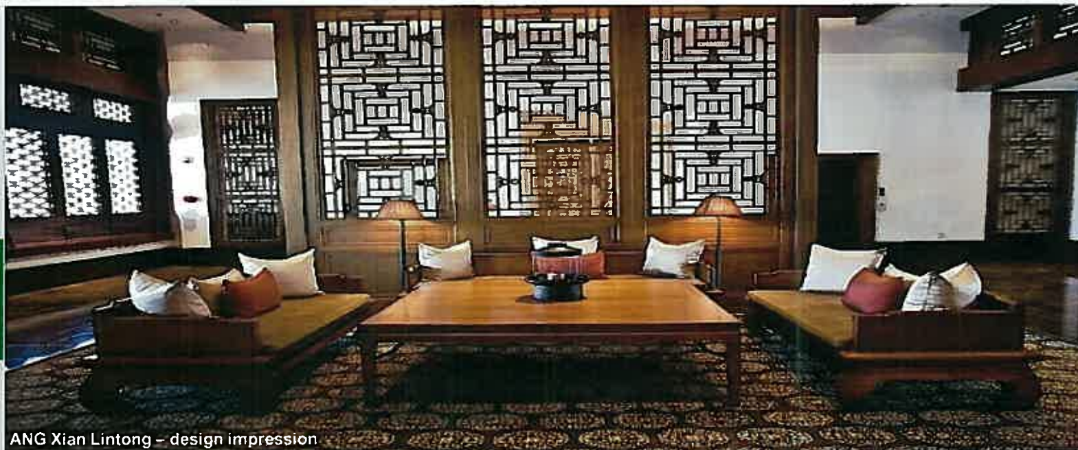
ANG Xian Lintong – design impression