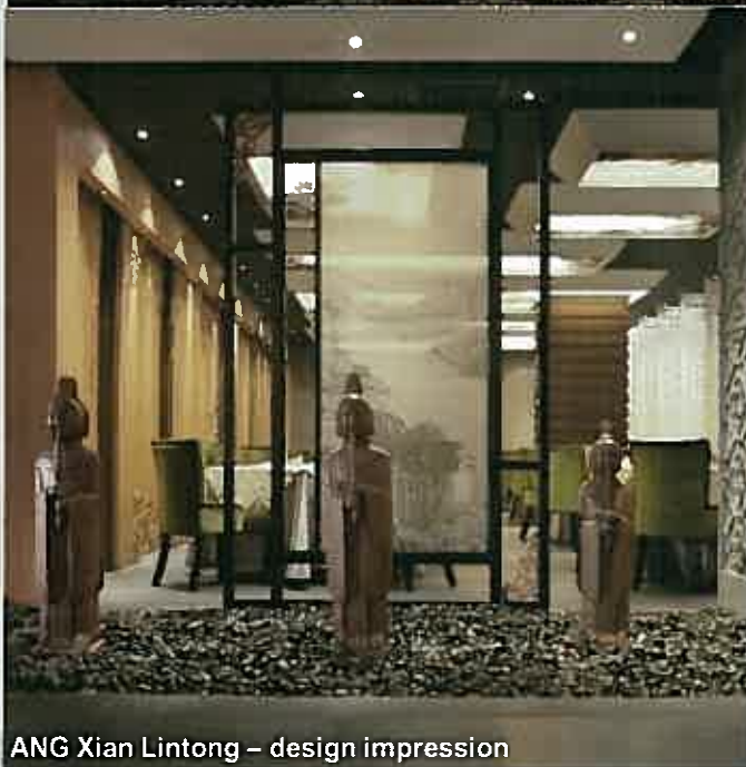
ANG Xian Lintong – design impression