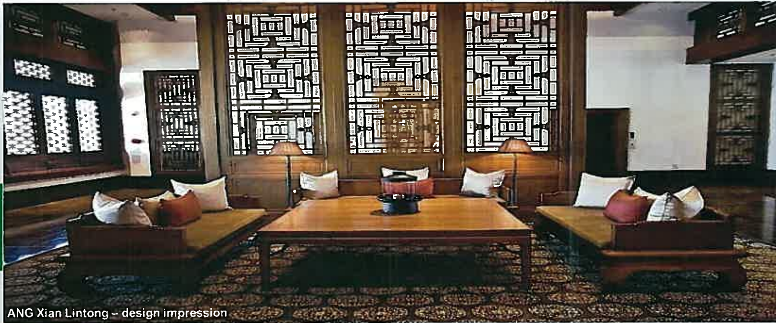
ANG Xian Lintong – design impression