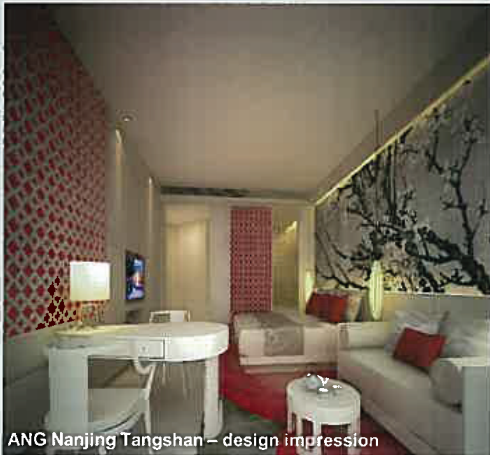
ANG Nanjing Tangshan – design impression