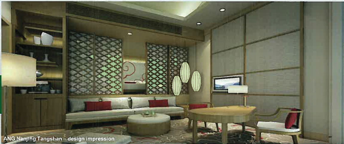
ANG Nanjing Tangshan – design impression