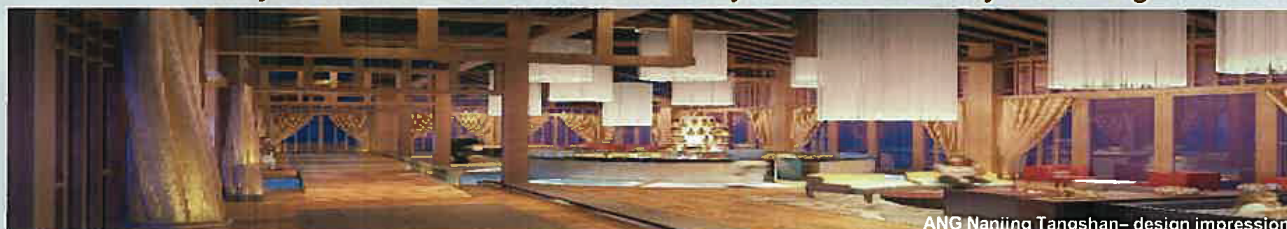
ANG Nanjing Tangshan- design impression