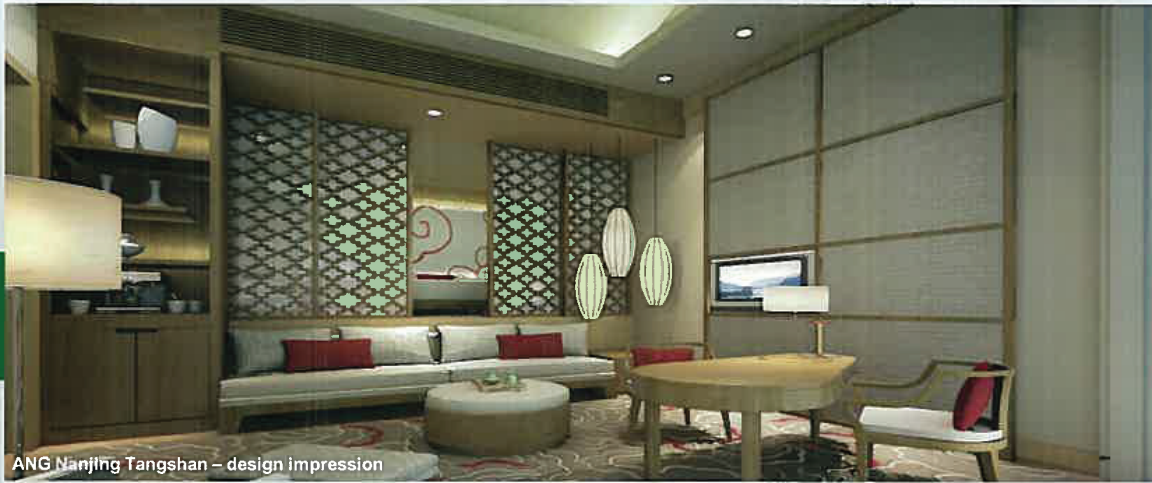
ANG Nanjing Tangshan – design impression