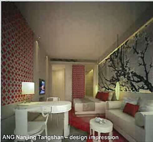
ANG Nanjing Tangshan – design impression